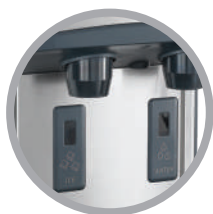
Touch-free infrared sensor dispensing option, providing more sanitary operation

HID312 - Touch-free Ice Machine / Dispenser