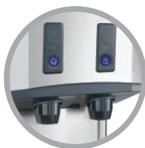
User controlled antimicrobial push-button dispensing option, providing quick and efficient operation