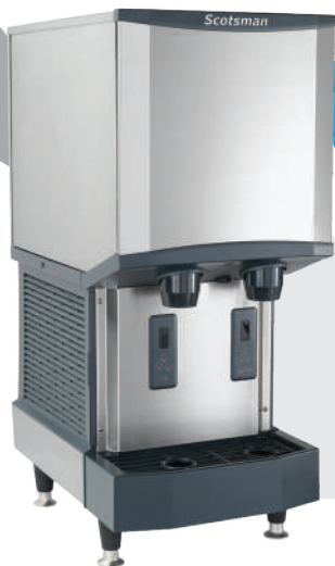
HID312A-1 with optional KLP24A legs

Sealed, maintenance-free bearings ensure maximum reliability and contribute to a long machine life