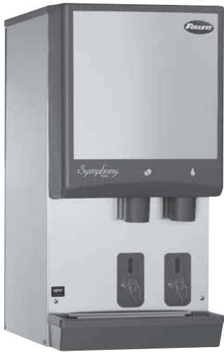
Shown with SensorSAFE™

C/E 12 CI series countertop with Chewblet® ice machine