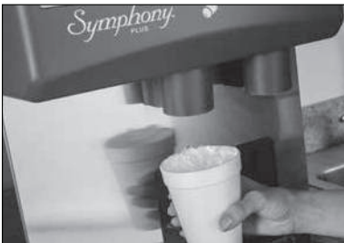
SensorSAFE not recommended for use with clear containers or for applications in direct sunlight