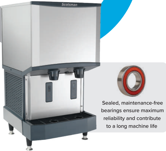
HID525A-1 with optional KLP24A legs